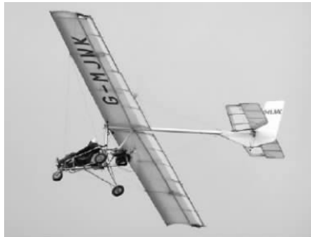
Figure 2.3 A typical ultralight vehicle, which weighs less than 254 pounds.

2. List the basic series of Light Sport Aircraft.