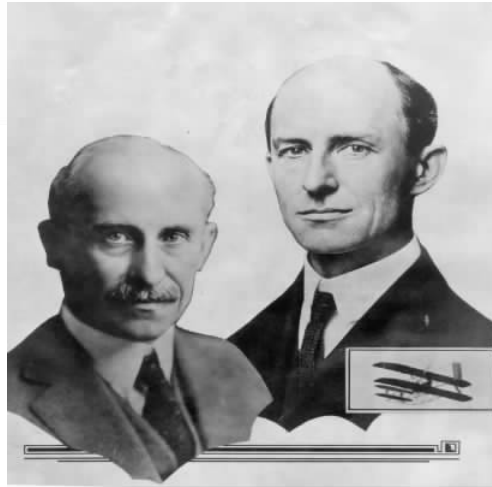
Figure 1.2 The Wright Brothers

2. Work in a group, and discuss the following question.