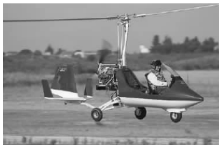
Figure 2.4 Gyroplane