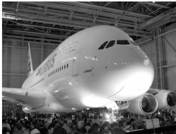
Figure 2.2 The first completed A380 at the “A380 Reveal” event