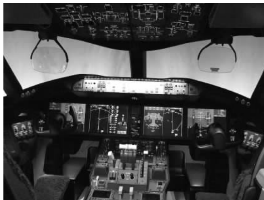
Figure 2.1 The Boeing 787 cockpit

(10) In order to prevent data transfer, the design contains the air gaps and firewalls.