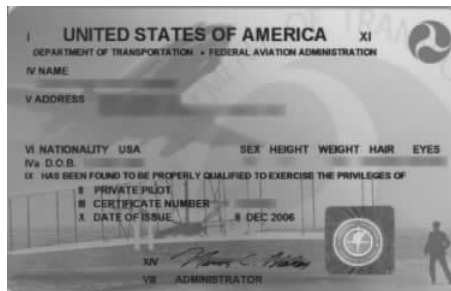
Figure 3.2 Pilot Certificate