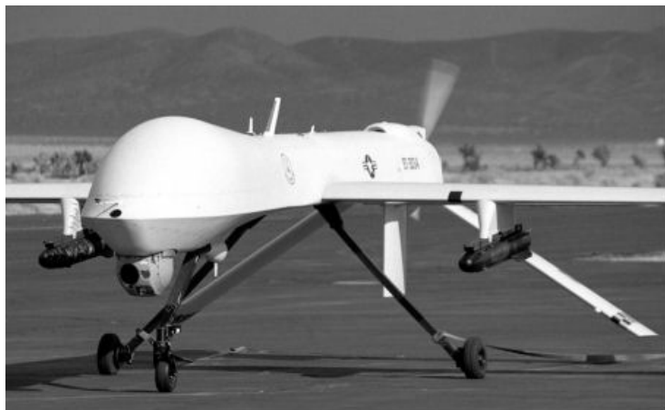
Figure 1-1 Introduction of Robotics: Military robots