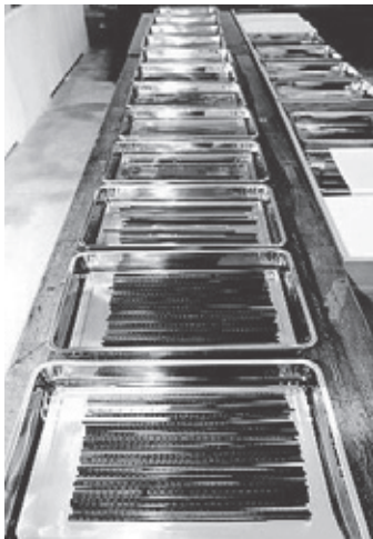
Tsinghua Slips in trays of distilled water