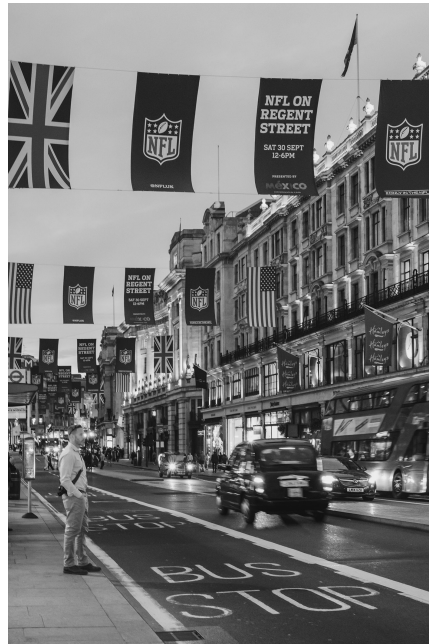
Exhibit 1-2 The National Football League (NFL) promotes American football globally. The NFL is focusing on a handful of key markets, including Canada, China, Germany, Japan, Mexico, and the United Kingdom. Every fall, banners are draped over London's Regent Street to create awareness of the International Series games played before sellout crowds at Wembley Stadium and Twickenham.