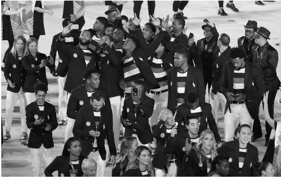
Exhibit 1-11 American fashion icon Ralph Lauren created the official uniforms that Team USA wore at the opening and closing ceremonies of the 2012 Olympics in China. Controversy erupted after it was revealed that the uniforms—navy blazers, white trousers and skirts, and berets—were “Made in China” rather than in the United States. Critics linked the outsourcing story to the broader issue of the loss of manufacturing jobs in America. Perhaps not surprisingly, the uniforms for the 2016 Summer Games in Rio were “Made in the USA.”