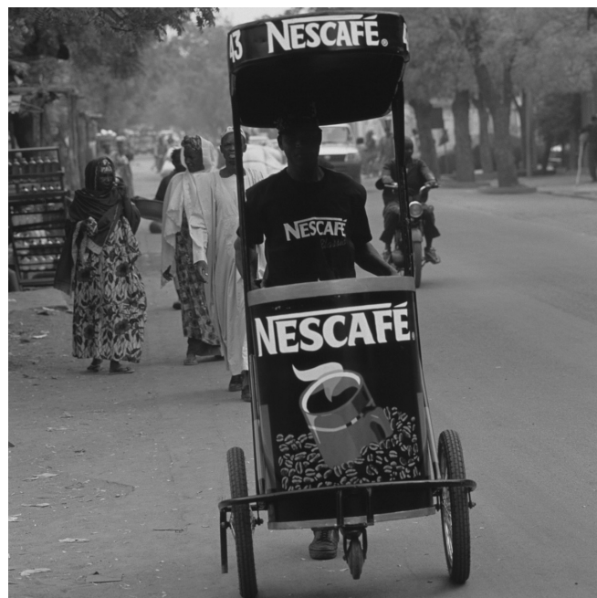
Exhibit 1-6 For Nestlé, innovation is the key to its expanded presence in emerging markets such as Thailand, Sri Lanka, and Mali. Recently, Nestlé introduced mobile coffee carts from which vendors sell single servings of Nescafé brand coffee. Some of these innovations are being transferred to high-income countries in Europe and elsewhere.

The Coca-Cola Company supports its Coke, Fanta, and Powerade brands with marketing mix elements that are both global and local. Dozens of other companies also have successfully pursued global marketing by creating strong global brands, in various ways. In consumer electronics, Apple is synonymous with hardware and software integration, ease of use, cutting-edge innovation, and high-tech design. In appliances, Germany’s reputation for engineering and manufacturing excellence is a source of competitive advantage for Bosch (see Exhibit 1-7). Italy’s Benetton utilizes a sophisticated distribution system to quickly deliver the latest fashions to its worldwide network of stores. The backbone of Caterpillar’s global success is a network of dealers who