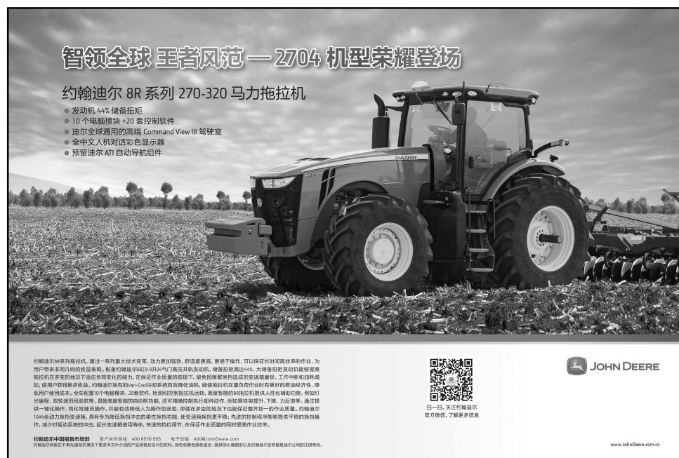
Exhibit 1-10 With annual sales of $26 billion, Moline, Illinois-based Deere & Company is the world’s leading manufacturer of farm equipment. Deere has benefited from booming worldwide demand for agricultural commodities; demand for tractors has been especially strong in Brazil, China, India, and other emerging markets.

The worldwide movement toward free markets, deregulation, and privatization is a third driving force. The trend toward privatization is opening up formerly closed markets; tremendous