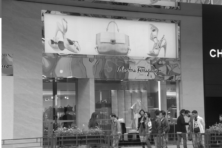
Exhibit 1-1 Salvatore Ferragamo, based in Florence, Italy, is one of the world's leading fashion brands. Ferragamo and other companies in the luxury sector face challenges as consumer habits change. Historically, the luxury shopper was brand loyal and had an eye for classic designs. Now, many shoppers pursue the "next big thing" via online retail channels.

The "global marketplace versus local markets" paradox lies at the heart of this textbook. In later chapters, we will investigate the nature of local markets in more detail. For now, however, we will focus on the first part of the paradox. Think for a moment about brands and products that are found throughout the world. Ask the average consumer where this global "horn of plenty" comes from, and you'll likely hear a variety of answers. It's certainly true that some brands—McDonald's, Dos Equis, Swatch, Waterford, Ferragamo, Volkswagen, and Burberry, for instance—are strongly identified with a specific country. In much of the world, Coca-Cola and McDonald's are recognized as iconic American brands, just as Ferragamo and Versace are synonymous with classic Italian style (see Exhibit 1-1).