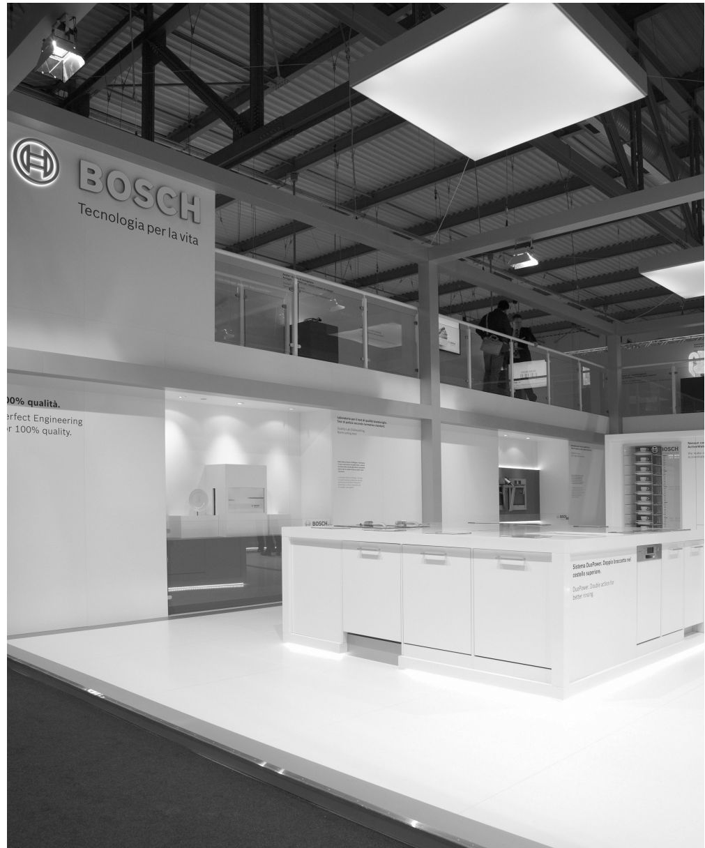
Exhibit 1-7 MILAN - ITALY - APRIL 2012: Salone internazionale del mobile 2012, furniture fair, Bosch.

support the company's promise of "24-hour parts and service" anywhere in the world. As these examples indicate, there are many different paths to success in global markets. In this book, we do not propose that global marketing is a knee-jerk attempt to impose a totally standardized approach on marketing around the world. Instead, a central issue in global marketing is how to tailor the global marketing concept to fit particular products, businesses, and markets. 37