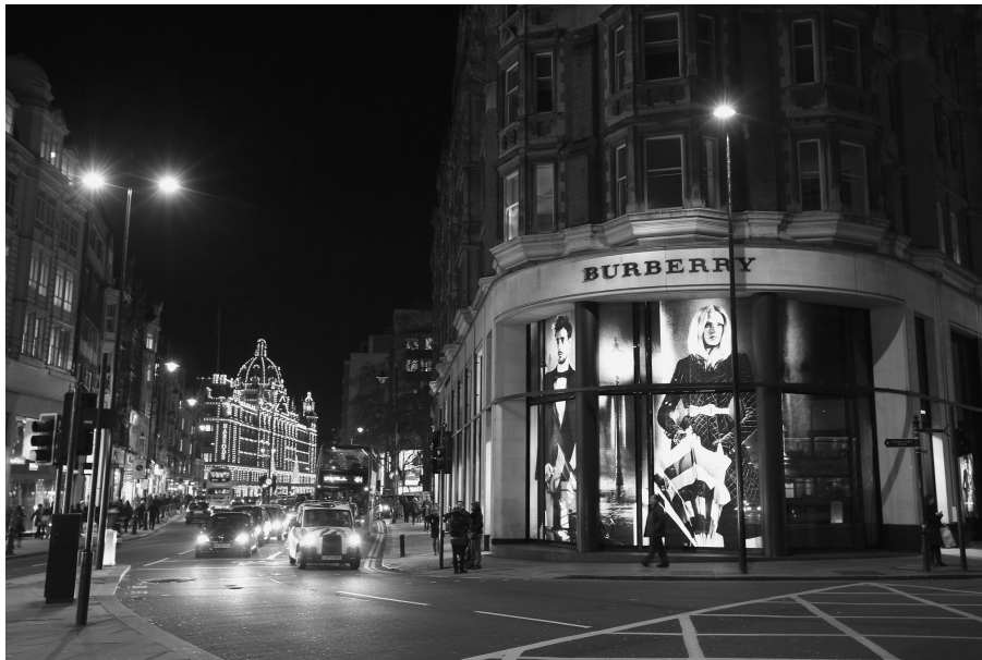
Exhibit 1-5 Thomas Burberry is credited with inventing gabardine fabric in the 1850s, paving the way for creation of the trench coat. England's Burberry Group celebrated its 160th anniversary in 2016. The Burberry trademark is registered in more than 90 countries.

As you can see in Table 1-3, the next part of the GMS involves the concentration and coordination of marketing activities. At Burberry, haphazard growth had led to a federation of individual operations. Company units in some parts of the world didn't talk to each other. In some cases, they