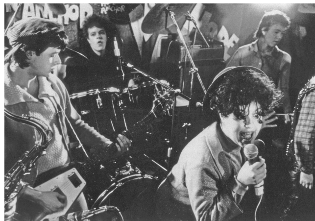
Exhibit 1-4 Among punk’s positive social effects was the empowerment of women. For example, Exene Cervenka fronted L.A. punk band X, and Poly Styrene (shown here) was the singer for London’s X-Ray Spex.