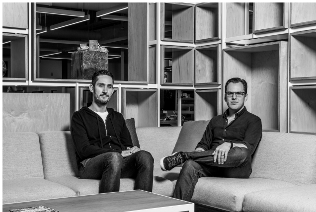
Exhibit 1-9 Stanford University graduates Kevin Systrom and Mike Krieger are Instagram's co-founders.