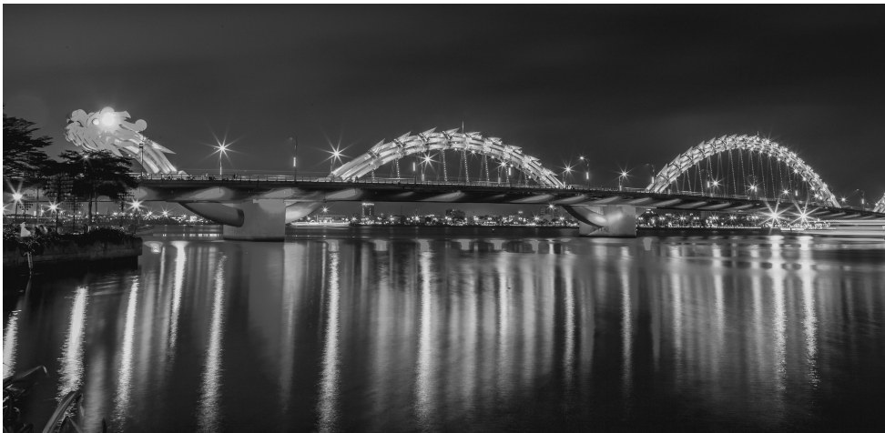
Exhibit 1-3 The Dragon Bridge in Da Nang is a major tourist attraction. The LED lighting is provided by Philips.

Examples abound of corporate executives addressing the issue of focus, often in response to changes in the global business environment. In recent years, Bertelsmann, Colgate, Danone, Electrolux, Fiat, Ford, Fortune Brands, General Motors, Harley-Davidson, Henkel, LEGO, McDonald’s, Royal Philips, Toshiba, Vivendi, and many other companies have stepped up their efforts to sharpen their strategic focus on core businesses and brands.